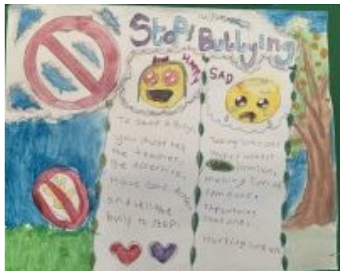
Anti-Bullying poster competition winner

Winner of the Anti-Bullying poster competition 2021- 2022, see posters displayed around the school.