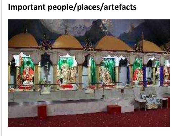
Murti's at Radha Krishna Temple in Stratford